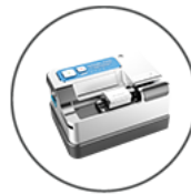
optical fiber cleaver