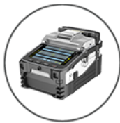
optical fiber fusion splicer